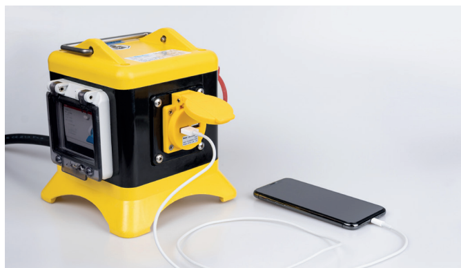
Perfect optical integration in a BALS Uni-Block.

We recommend the installation of a pre-fuse 1A e.g. G-fuse type 9631 with fuse terminal type 581450